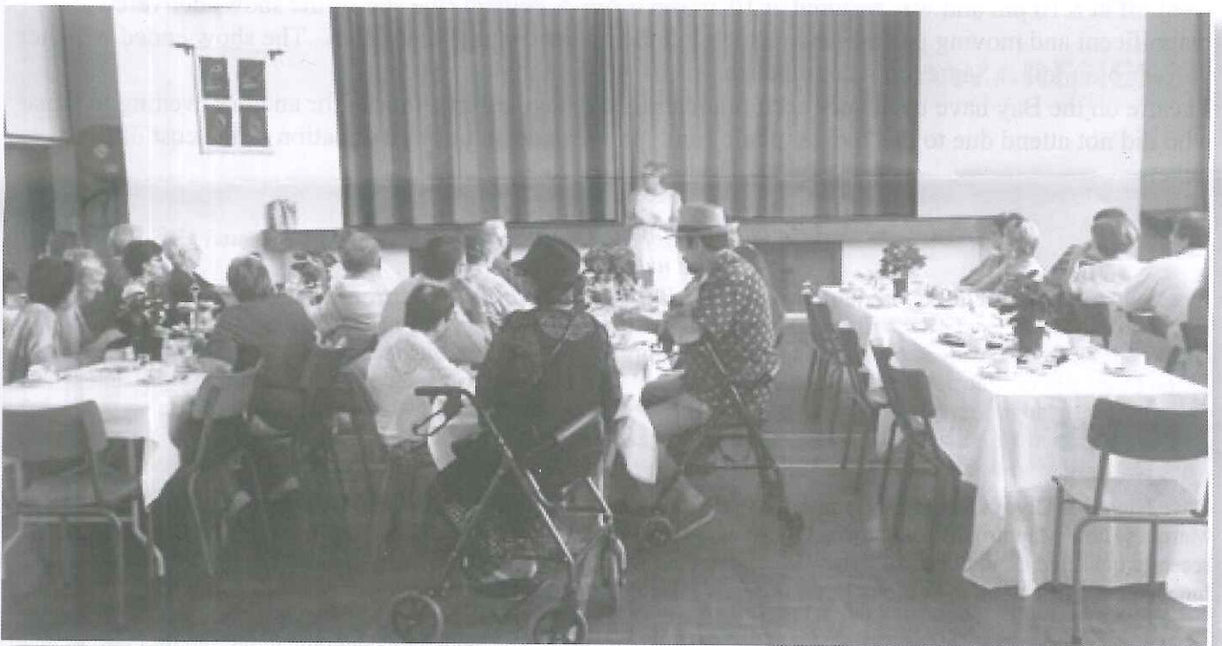
Tea Party in Bellville