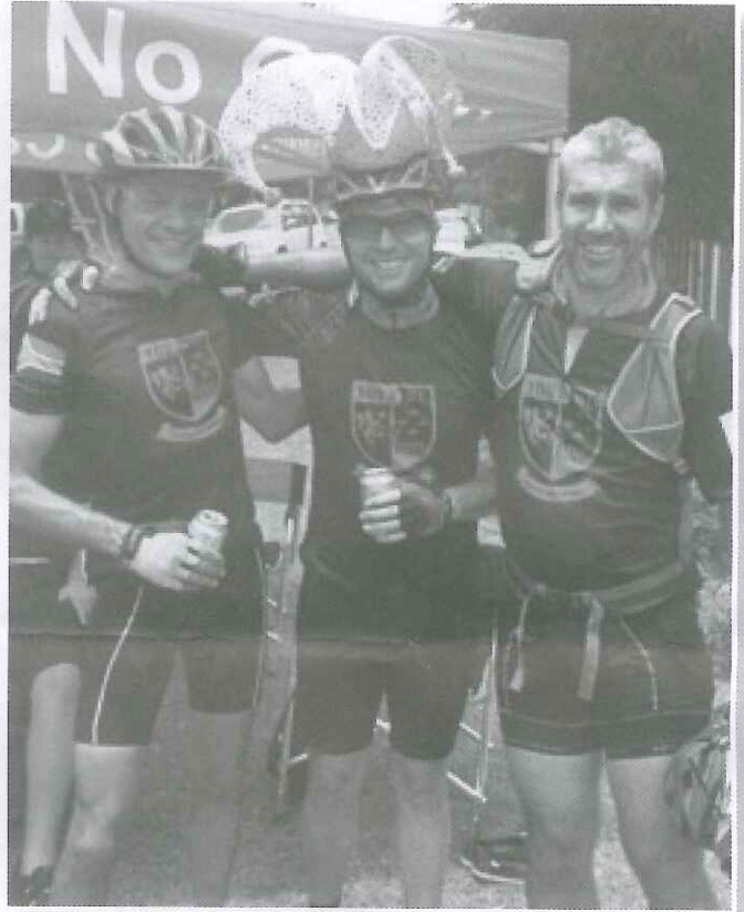
Momentum 94.7 Cycle Challenge

Carla says: "Our first event for 2015 will be taking place in April and details will be posted on our facebook page 'You and me versus MND' shortly and she encourages people to 'like' their page, and join them at future events in the support and awareness of MND in South Africa!